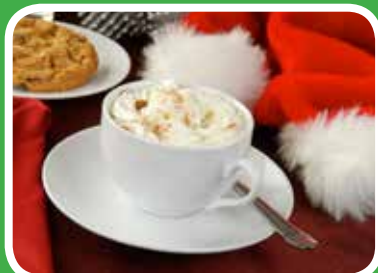
Breakfast with Santa Page 7