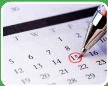
Calendar of Events Page 12