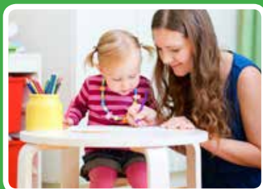
Babysitters Page 10