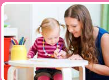
Babysitters List Page 7