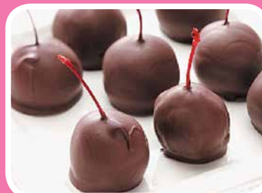
Chocolate Dipped Cherries Page 7