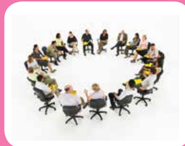
Annual Meeting Page 5