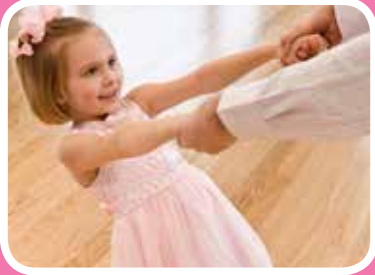
Daddy Daughter Dance Page 3