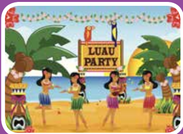
School's Out Luau Party Page 3