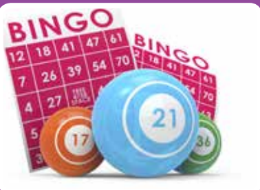
Bingo Dates Page 11