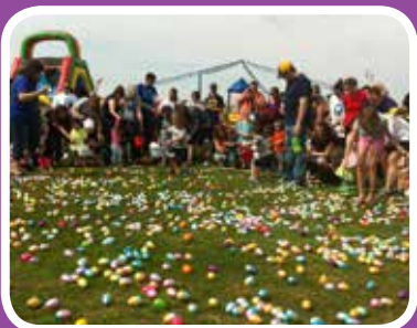
Bunny Hop Run and Egg Hunt Page 9