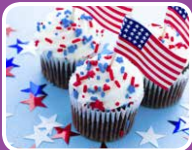
4th of July Celebration Page 3