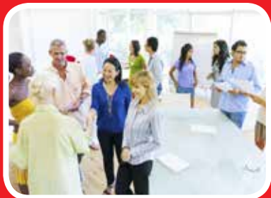
New Resident Meet and Greet Page 3