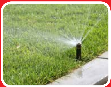
Watering Schedule Page 6