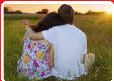
Date Night - Movie in the Park Page 8