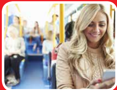
Fort Worth Transportation Authority - Page 4