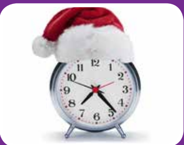
Holiday Hours Page 7