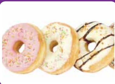
Coffee & Donuts Page 5