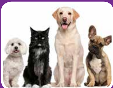
Covenant Corner Page 4