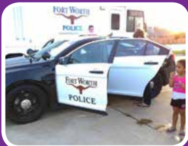
National Night Out Page 3