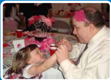
Daddy Daughter Dance Page 9