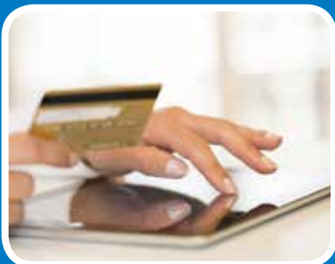
Online Bill Pay Page 10