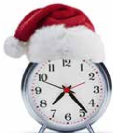
Holiday Office Hours Page 7