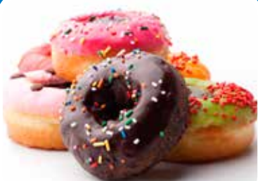
Coffee & Donuts Page 8