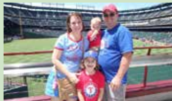
Tony sold our home in less than 24 hrs at full asking price