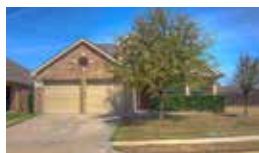
2118 sq. ft. | 3 bedrooms | 2 baths