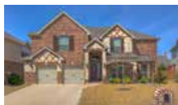
4243 sq. ft. | 5bedrooms | 4 baths