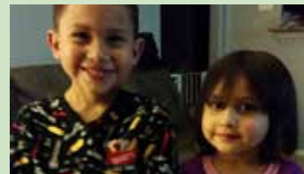
Tony sold our home in less than 72 hrs above full asking price