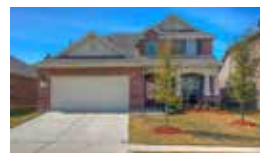
2538 sq. ft. | 4 bedrooms | 3.1 baths