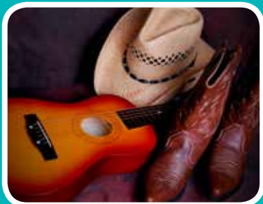
Mother Son Social Page 3