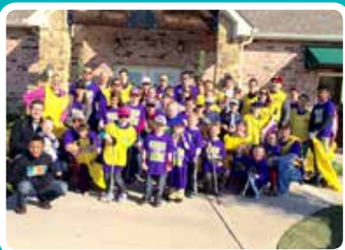
VOWS Spring Clean Up Page 8