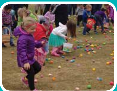
Bunny Hop and Egg Hunt Page 9