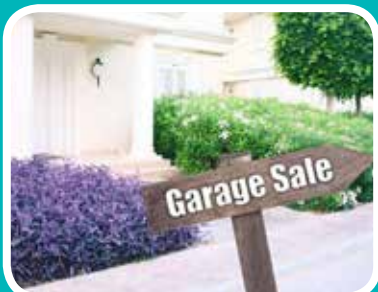
Community Garage Sale Page 7