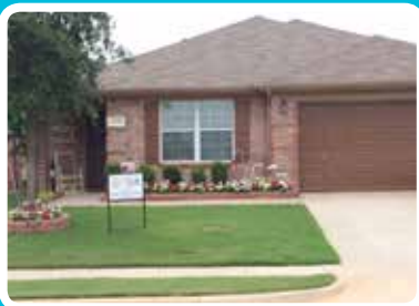
Yard of the Month Page 7