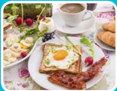
End of Summer Breakfast Page 3