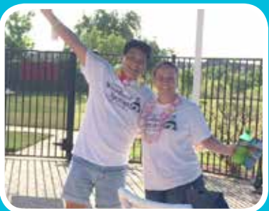
School's Out Luau Page 9