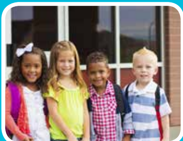
Back to School Safety Tips Page 4