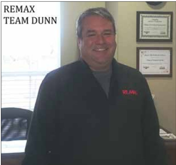
REMAX TEAM DUNN

Runners and egg hunters were hopping on a sunny day in March. A 1-mile fun run preceded the 5k race thru our villages. Kids jumped in bounce houses, petted cute animals, and hunted for eggs. Thank you to the volunteers that helped put the event on, and for ReMax Team Dunn for their sponsorship contribution towards the races to allow a greater donation to the Community Storehouse.