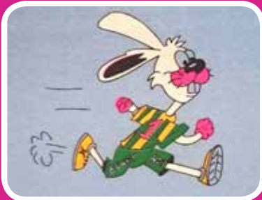
Bunny Hop T-shirt Winner Page 7