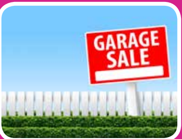
VOWS Garage Sale Page 14