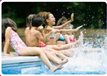
Pool Season News Page 5