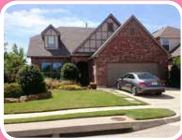
Yard of the Month Page 6