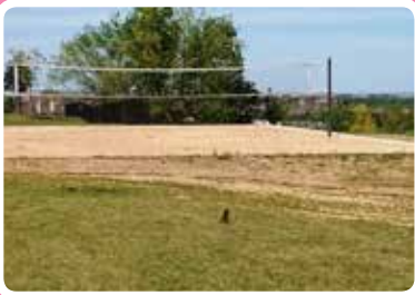
New Sand Volleyball Courts Page 3