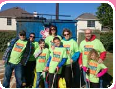
VOWS Clean Up Day Page 8