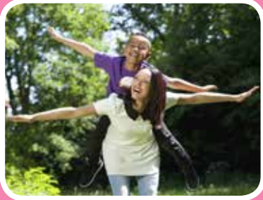
Mother Son Social Page 3