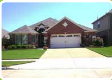
Yard of the Month Page 6