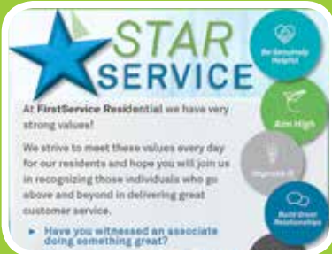
Star Service Page 8