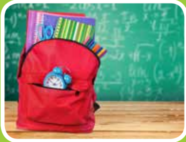
VOWS Back to School Fair Page 4