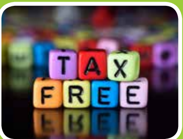
Sales Tax Free Weekend Page 14