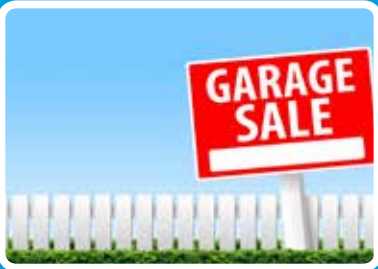
Garage Sale Page 4