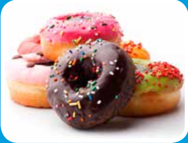
Residents Coffee and Donuts Page 3