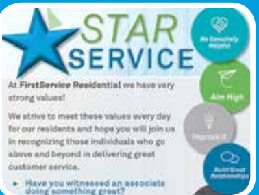
Star Service Page 11