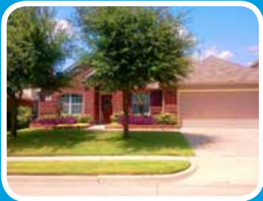
Yard of the Month Page 6