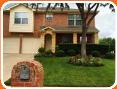
Yard of the Month Page 6