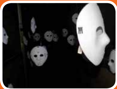
The Boneyard VIII Page 7