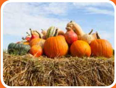
VOWS Fall Festival Page 5