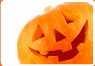
Jack O'Lantern History Page 3