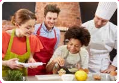
VOWS Cooking Classes Page 7