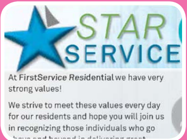
Star Service Page 14