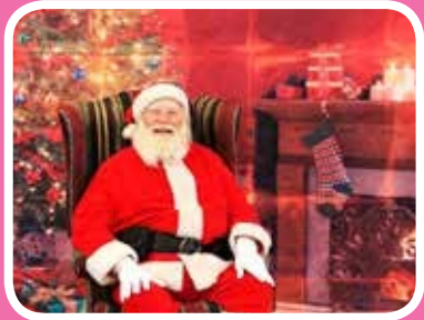
Breakfast With Santa Page 9