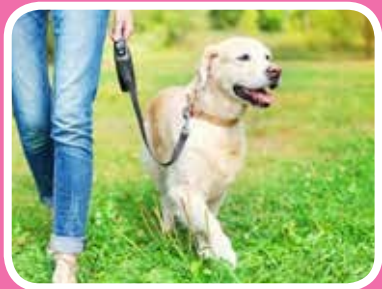
Man's Best Friend Page 13