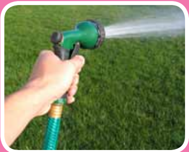
Water Restrictions Page 4