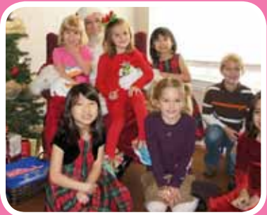
Breakfast with Santa Page 7