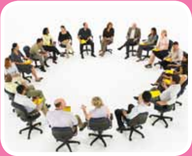
Annual Meeting Page 3