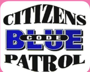
Code Blue Page 10