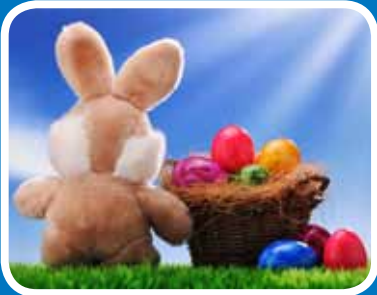
Bunny Hop Page 3