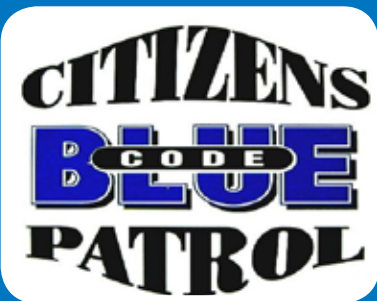
Code Blue Page 7