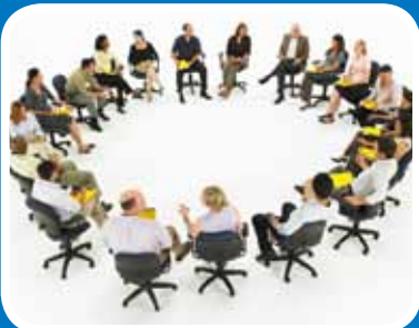
Advisory Committee Meeting - Page 11