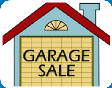
Annual Garage Sale Page 7