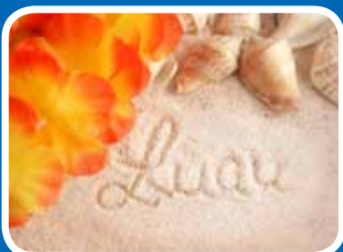
School's Out Luau Page 6