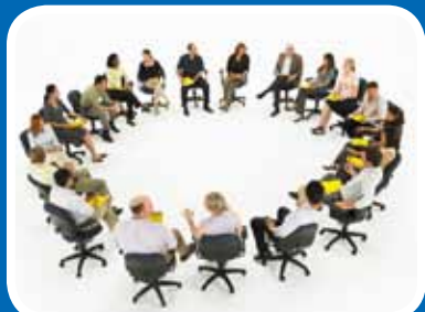
Advisory Committee Meeting Page 5