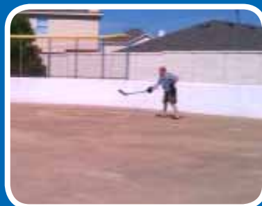
Hockey in VOWS Page 9