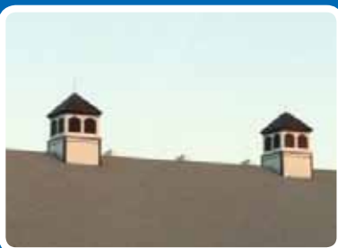
Have You Seen This Spot Page 6