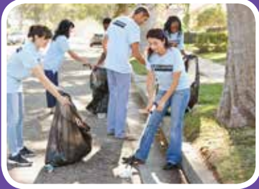
VOWS Neighborhood Cleanup Page 3