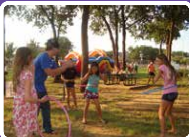
Eagle Scouts Page 10