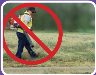
No Grass Clippings in the Street Page 8