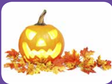
VOWS Fall Festival Page 5