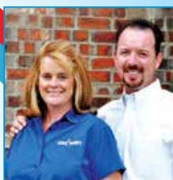
Family Owned and Operated