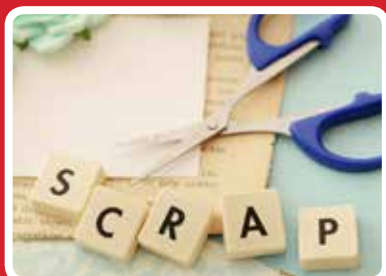
Scrapbooking Dates Page 11