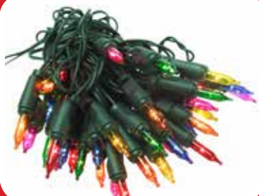
Covenant Corner Page 5