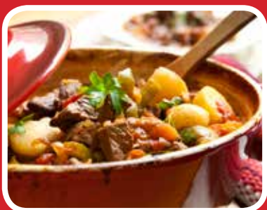
Beef Stew Page 8