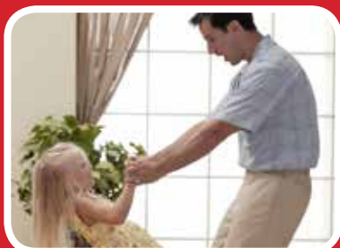
Daddy Daughter Dance Page 6