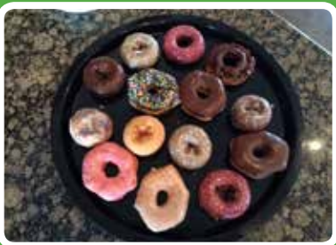
Coffee & Donuts Page 9