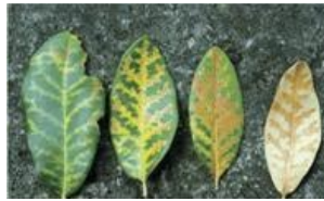
Venal necrosis in live oak leaves.

Infected red oaks that die late summer or fall should be cut and burned or buried as soon as discovered to prevent the spore mat from producing in the spring.