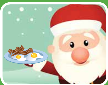
Breakfast with Santa Page 8