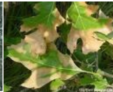
Oak wilt pattern in red oak leaves

All wounding (including pruning) should be avoided from February to June. The least hazardous periods are the hot summer days or cold days of winter.