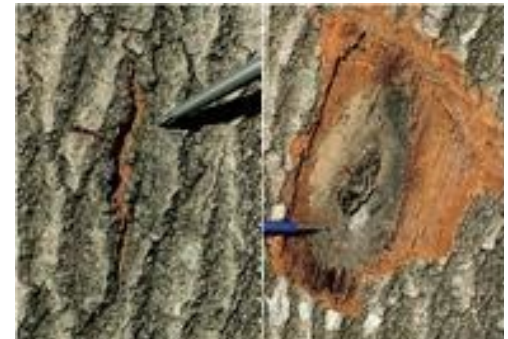
Fungal mat on bark of red oak.

This method is not typically used in city settings. Approximately 4 feet from the base of the trunk a trench is dug to sever the roots. This allows for a trench to be made. This is easier to perform on smaller trees than estab-