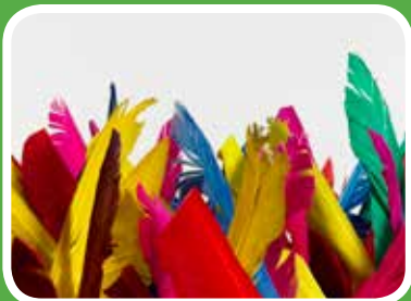
Thanksgiving Crafts Page 6