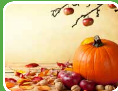
Holiday Hours Page 7