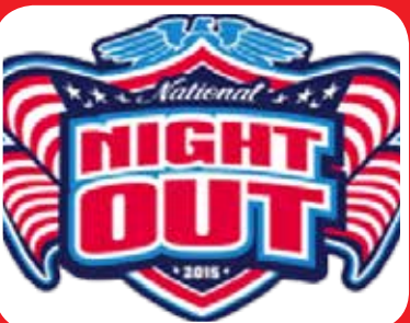
National Night Out Page 6