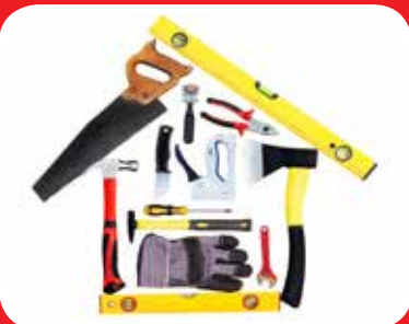
Covenant Corner Page 4