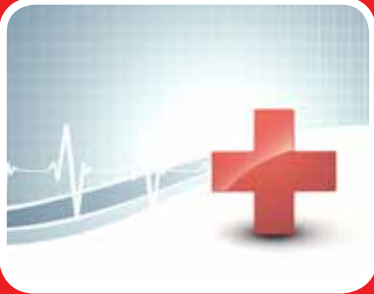
Health and Wellness Fair Page 3