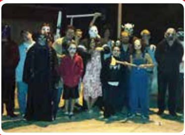
Bone Yard Coming Soon! Page 5