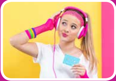
80's Dance Party Page 5