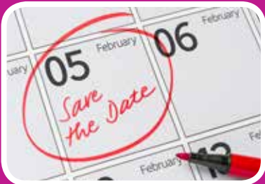
HOA Annual Meeting Page 10