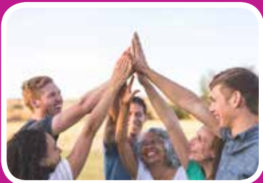
Volunteerism Page 12