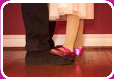
Daddy Daughter Dance Page 9