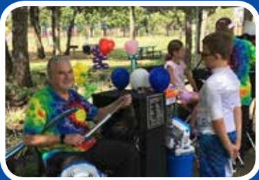
Thank you Solea Page 7