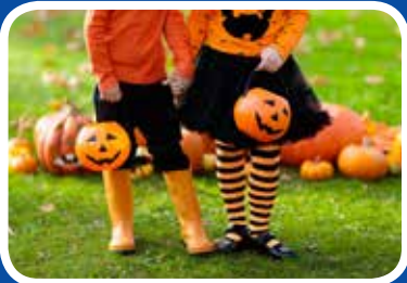
Code Blue Connection Page 10