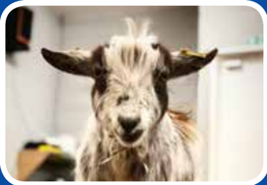
Goat Yoga Page 9