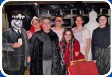
The Boneyard Page 5